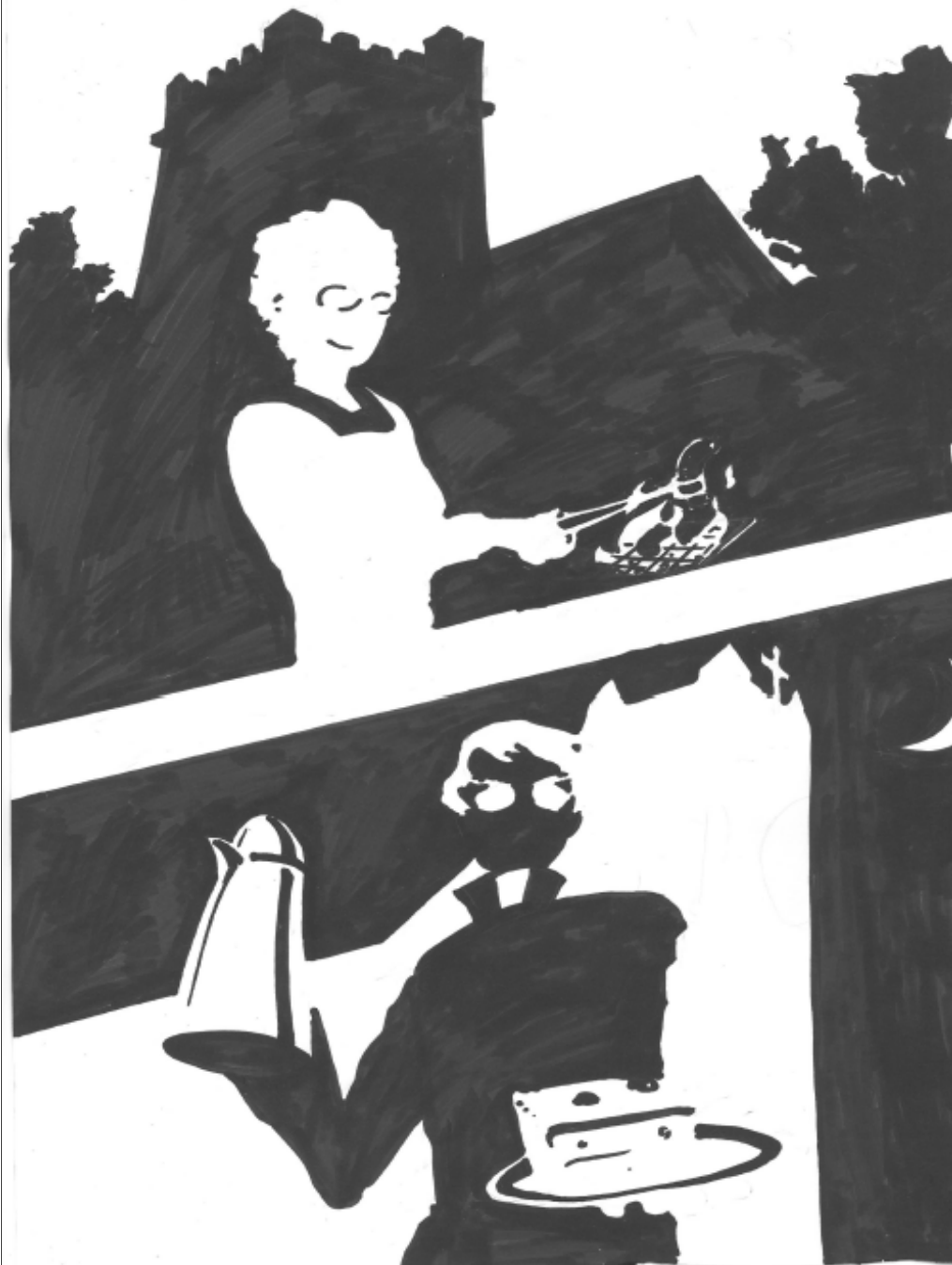
OPEN TABLE/NIGHT CHURCH: See page 2 for details. (Illustration: James Asher)

If you can help, please contact Jesse Root at 613-240-8221, jesseroot@gmail.ca or Sean Barron at 613-885-4310.